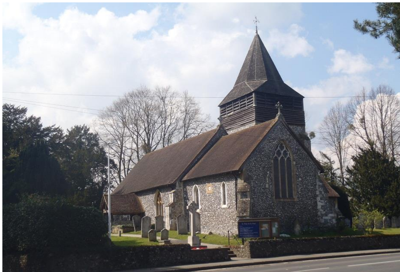
St. Peter & St. Paul Church, West Clandon, Surrey

St. Peter & St. Paul Church Cemetery, West Clandon contains 11 Commonwealth War Graves – 10 from World War 1 & 1 from World War 2.