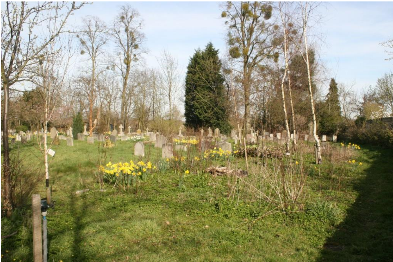
St. Peter & St. Paul Church Cemetery, West Clandon, Surrey