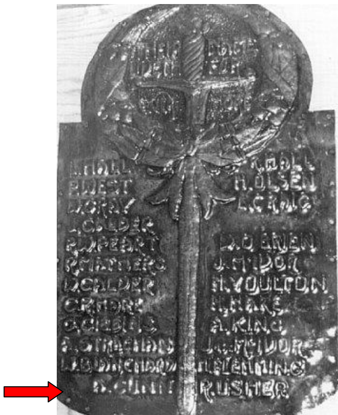
Cohuna State School Honour Roll