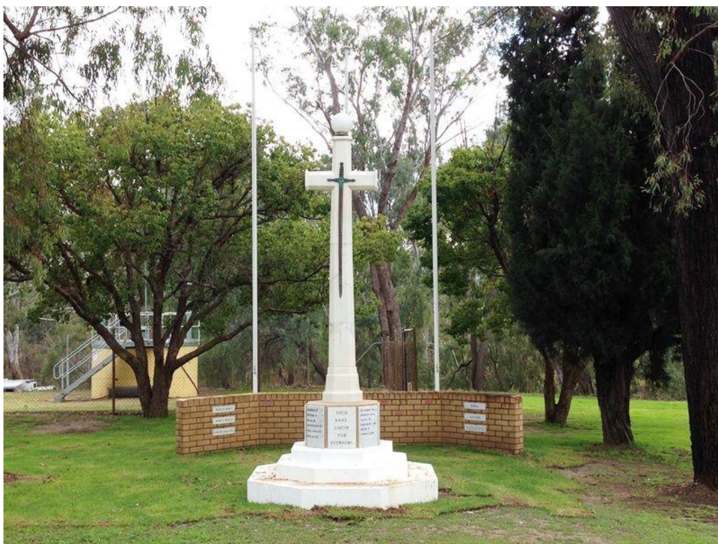
Surat War Memorial