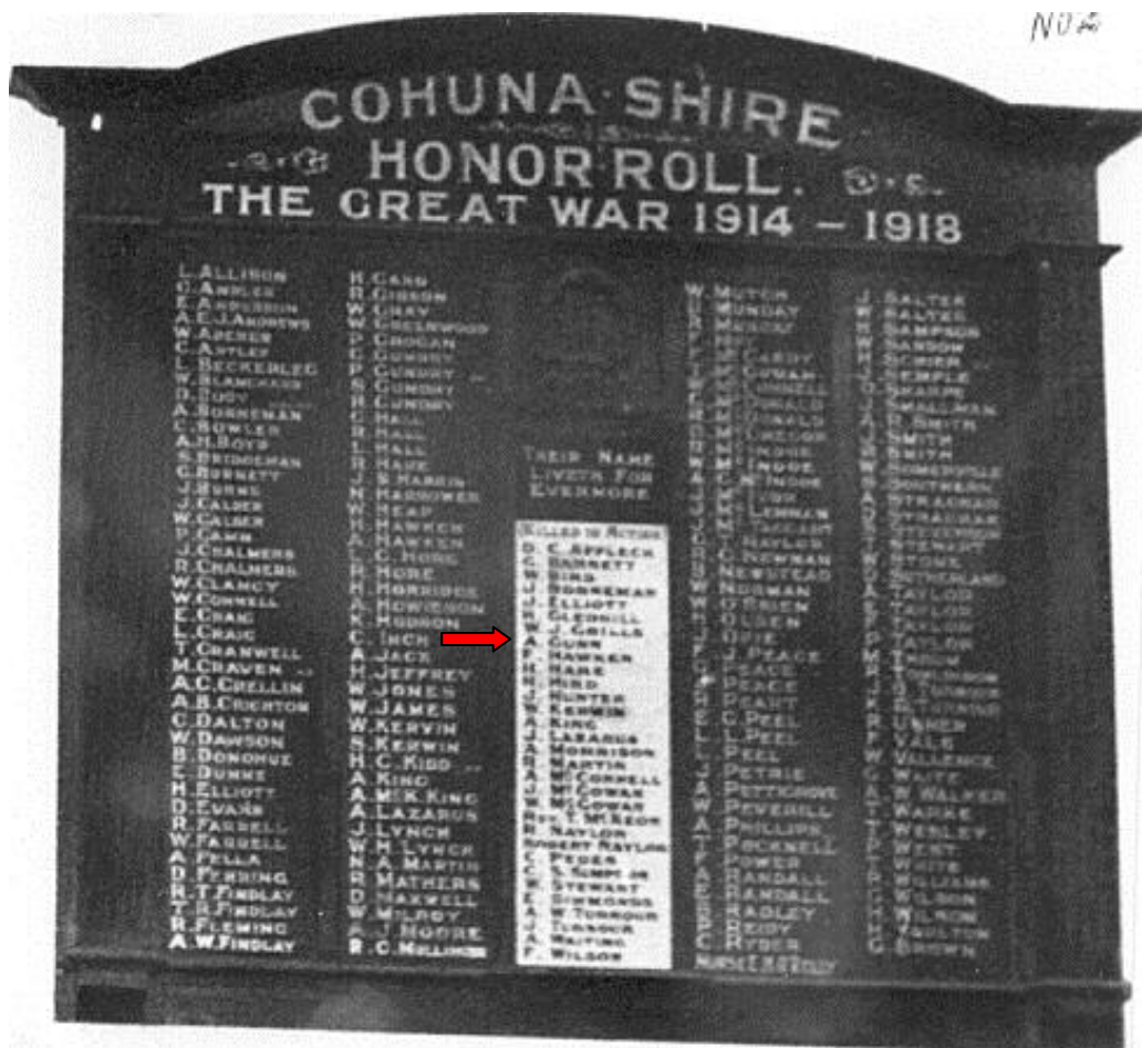
Cohuna Memorial Hall Honour Roll